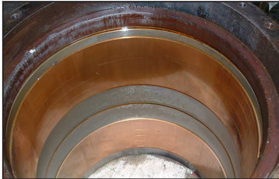
Worn rod guide bushings (with spiral oil grooves).

During the shear cycle of billets, excessive shear force was generated on the cutting blades. This high shear force should have been transferred and handled by the sliding pads of the blades. However they wore out quickly, generating unexpected high lateral force on the blade operating cylinders.